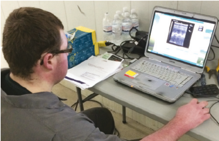
Recording the image and data

activity (especially growth and mortality), at any stage of production, can be recorded easily using a hand-held RFID reader. At 22 weeks of age, all CCPS candidates are off-tested. A quick scan of the RFID tag records all information pertaining to the individual including its ID, pedigree and weight. Back fat and loin depth are measured using an Aloka SSD-500V scanner and recorded in the individual pig's unique database. Individual animals may also be tracked through slaughter to gather data on carcass composition and meat quality traits.