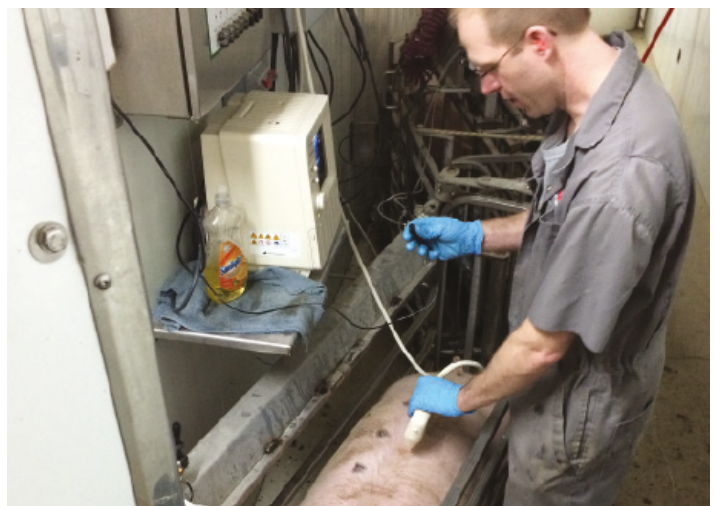
Aloka scanning while pig is suspended

For more information on the CCPS program please contact Topigs Norsvin or a representative in your area.