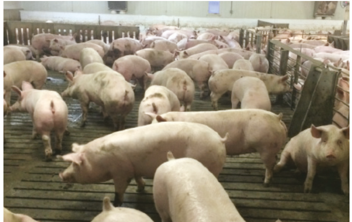
Uniform CCPS Tempo Pigs

Special off-test penning and equipment has been installed in the Blumengart facility. Pigs are moved into a central hallway for weighing and probing of individuals. A probe scale with a stainless steel, hydraulic pig lift is used to raise each pig off the ground allowing the technician to measure loin and back fat accurately while the pig is suspended.