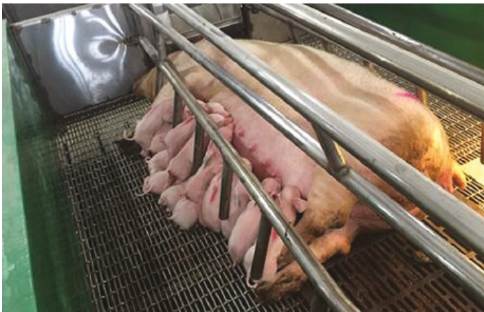
First litter at Crider Farms (March 9, 2015)

Today, Crider Farms is managed by Great Plains Management and utilizes large-pen gestation with ESFs and turn-around farrowing crates in the production of Topigs Norsvin 70 gilts. Crider noted, "The Z-line is calm and easy to train and move through the farm. I can't believe that we have only experienced gilt litters so far." The best is yet to come.