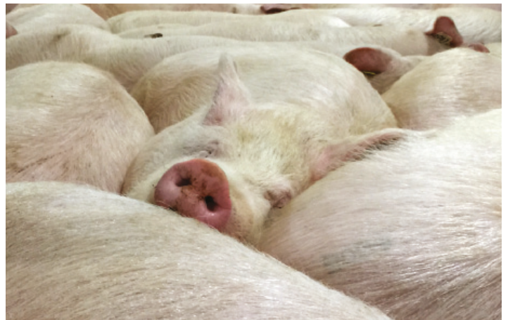
Docile Z Line females at Crider Farms