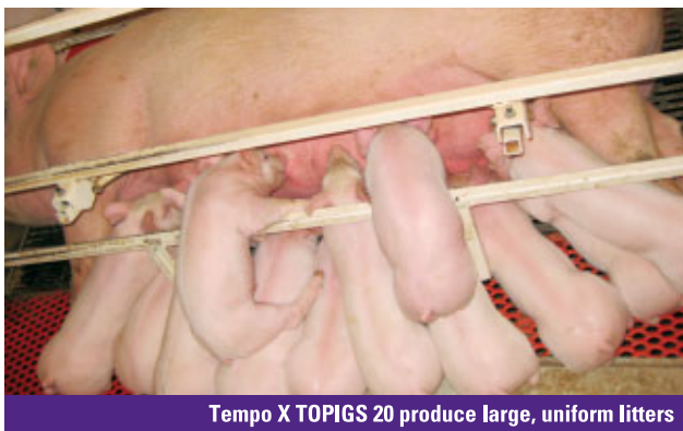
Tempo X TOPIGS 20 produce large, uniform litters

While the average parity of both TOPIGS lines at each farm is very low, the TOPIGS females are achieving some outstanding production numbers never seen before on these two farms. Jeroen comments, "The TOPIGS sows fit in a barn where the sow has to do the work and she doesn't need much attention. In our barns we need sows that do the work and don't need baby sitting. The TOPIGS 20-Line farrows easily, starts milking well and goes onto feed well after farrowing, which is half the battle in sow management. She is an excellent mother and weans lots of high quality piglets."