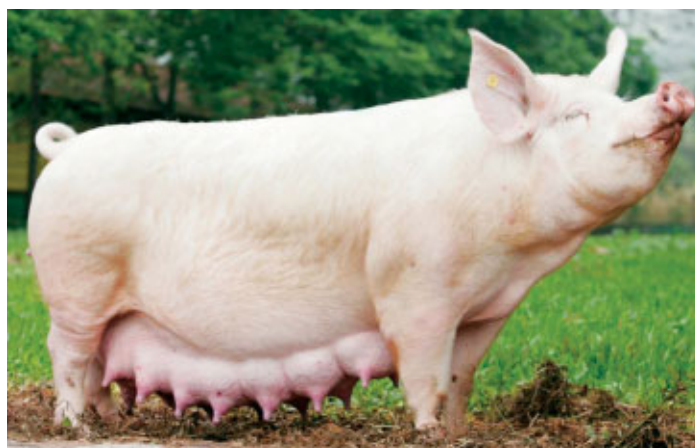
The highly prolific Z-Line

A great genetics program begins with a solid foundation and TOPIGS has that solid foundation. One of the key building blocks of the TOPIGS maternal program is the Z-Line female. A purebred Large White line, the Z-Line has been developed and selected for key performance traits over many years. This female will excel in traits of litter size, piglets weaned, maternal disposition and longevity. The basis of several breeding programs within TOPIGS, the Z-Line is prominent in multiplication units and InGene® programs around the world. The TOPIGS 20-Line female is created by using the N-Line (Landrace) semen on the Z-Line sows. Contact us for more information on producing your own 20-Line gilts with an InGene® program.