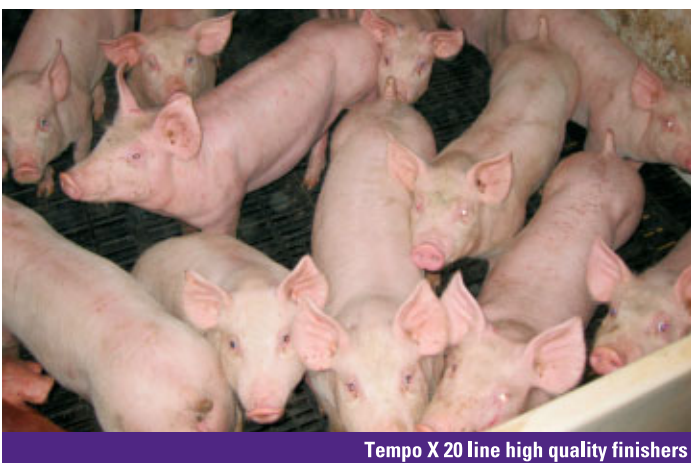
Tempo X 20 line high quality finishers

Several changes took place in 2007. The Greyland nursery and finishing was expanded to bring it to a full farrow to finish unit. While the Danbred females had performed better than