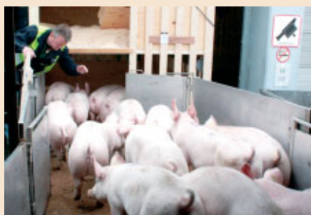
Export to Japan

TOPIGS exported 355 gilts from the Netherlands to Japan in March. This is the first time that TOPIGS breeding material has been sent to Japan. The TOPIGS 20 gilts of various ages came from Van Beek SPF Varkens in Lelystad. The gilts flew to Tokyo via Schiphol. After a state quarantine period the gilts will go to their final destination, a group of cooperating pig farmers. This group of independent pig farms produces about one-third of Japanese pigs. In June a second consignment with purebred line animals and terminal boars will be sent from the SPF nucleus breeding farm of TOPIGS in Canada.